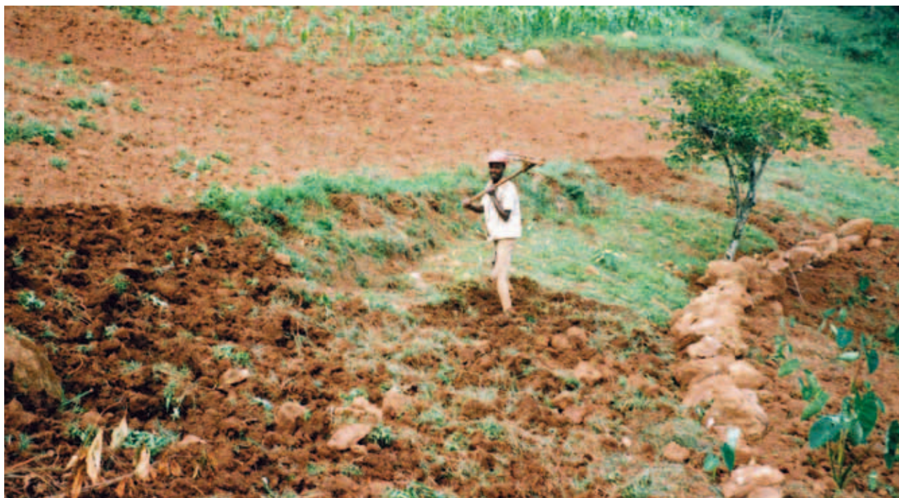
Productive land use is essential to meet competing needs and demands. Cultivation on steep slopes in Wollaita, southern Ethiopia.

Establishing better standards for transparency and accountability and increased international pressures and support to implement such standards will be important to reduce levels of corruption and elite capture.