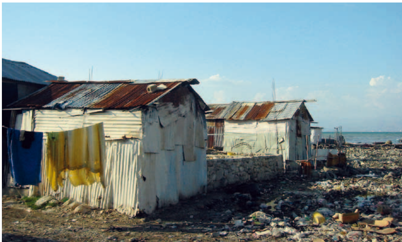
Urban slum on the waterfront, Haiti. Most of Port-au-Prince's residents live in vulnerable areas.

Furthermore, monitoring of climate change in selected cities and capacity building and knowledge sharing will be central activities.