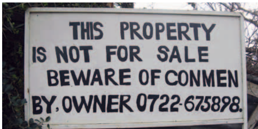
Tenure insecurity can undermine land markets and the productive use of land.

“ Short-term rental contracts are more likely to be associated with poor land management. ”