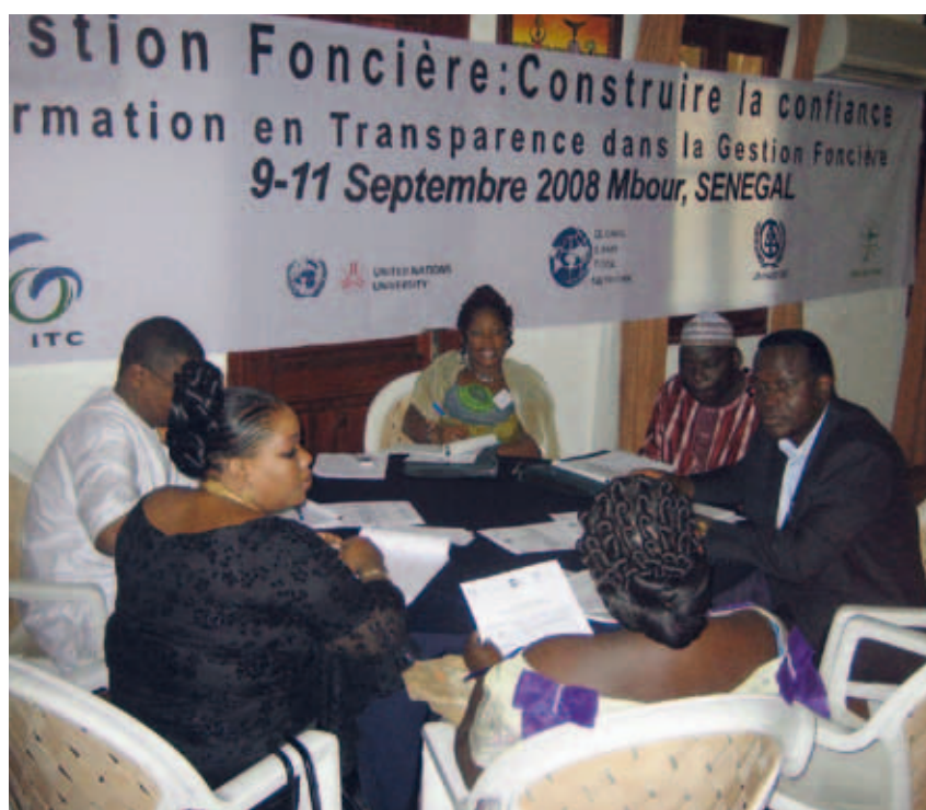
Capacity building, innovation and joint effort are important ingredients of success.

Concerns about environmental consequences may call for regulation of land rental markets, particularly if the rental contracts are of short duration. Short-duration contracts can suppress investment incentives, leading to non-sustainable land management practices. Some evidence of that has been found in Uganda by Nkonya et al. (2008), however, the cause may not always be clear i.e. whether landowners prefer to rent out their poorly managed land, or whether poor management is a consequence of the land being rented out. This requires further investigation under diverse conditions since land renting has become so common and is on the increase in many parts of the world.