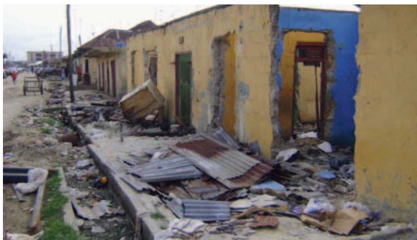
Pikine, Dakar; houses of residents being destroyed

The final agreement made in one region between the local government and farmers' organizations was that farmers could cultivate up to 40% of their land area if this area was flat and not exposed to erosion. An additional requirement was to establish sufficient buffer zones near lakes, streams and rivers. The agreement also included compensating farmers who suffered economic losses due to the program.