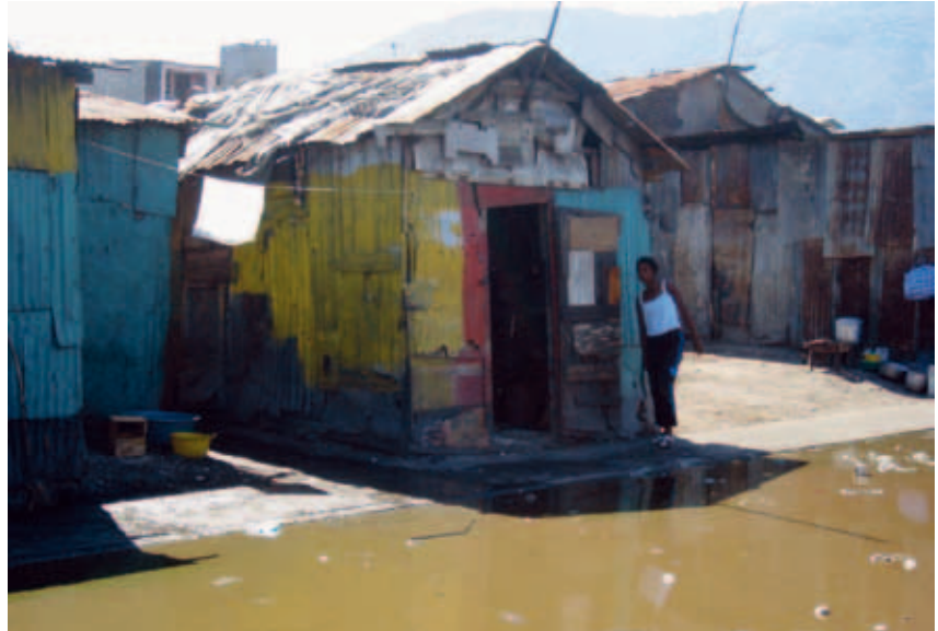
Tenure security for people in slums is an important step towards improving living conditions.

2. Can the property rights of poor land users in peri-urban areas be better protected and compensated in cases of eviction?