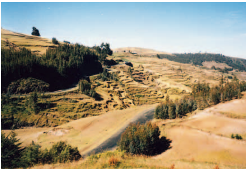
Woodlots on small farms in North Shewa, Amhara Region- Ethiopia.

most of them this is not so clear. If intensity of production is lower on rented land then this may have ambiguous effects on long-term land productivity.