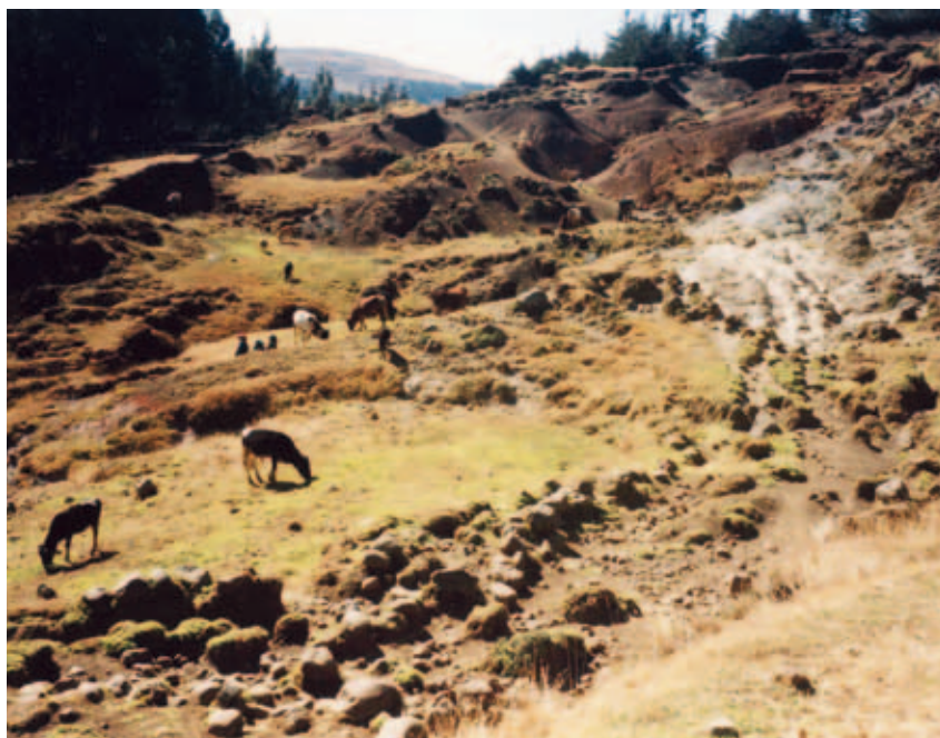
Land degradation caused by overgrazing and lack of soil conservation, Amhara Region, Ethiopia

Negotiated land reforms have been attempted that rely on voluntary land transfers based on negotiations between buyers and sellers and governments providing grants for the buyers, to reduce the political tensions (Deininger, 2001). Box 3.13 describes the experience with negotiated land reform in Columbia.