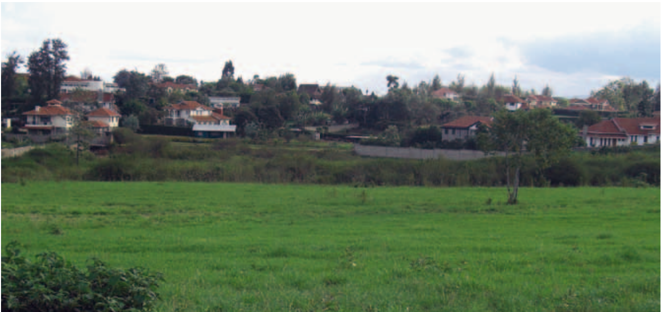
Productive land use is essential to meet competing needs and demands.