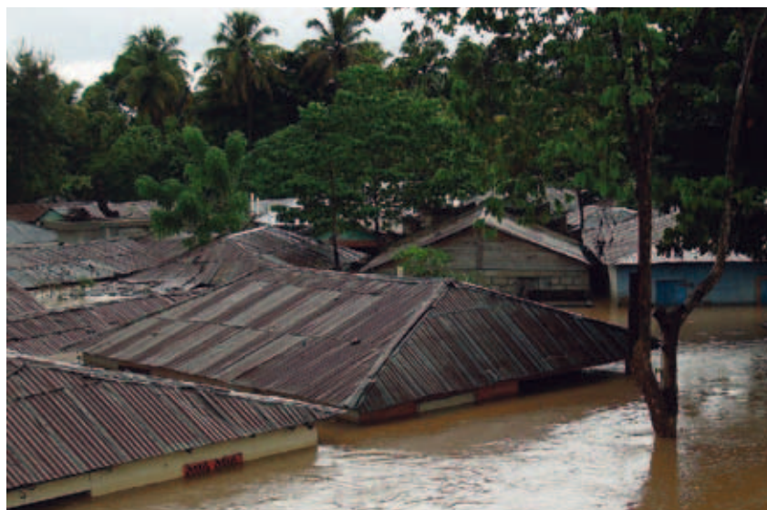
Extreme flood events will be more frequent as the planet heats up.