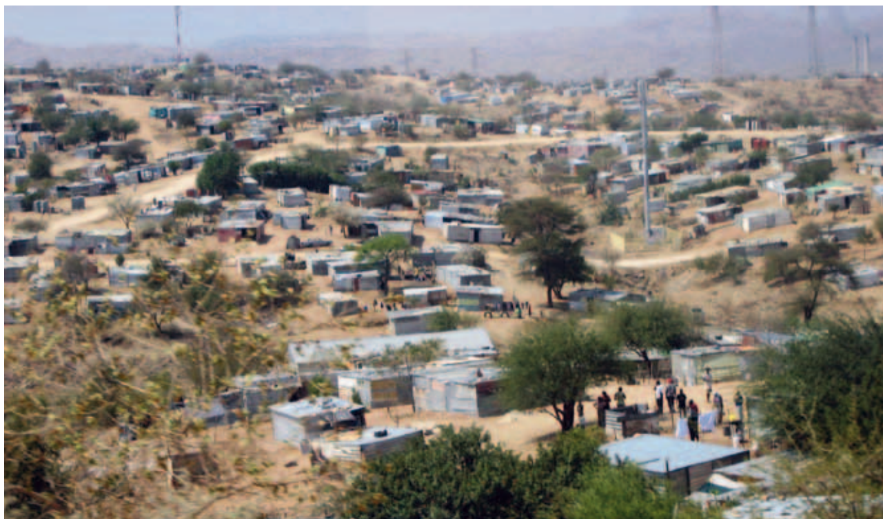
Windhoek, Namibia: City Councils face many challenges in managing peri-urban growth.

The heterogeneity of the group in some cases undermines cooperation while in other cases certain types of heterogeneity enhance collaboration. In cases where collective action fails to work it may be better to specify more individual property rights to enhance sustainable land management. It may also be difficult to implement big investment projects, like building irrigation dams, purely based on collective action. Such large investments require some additional funding and incentive payment (Baland and Platteau, 1996).