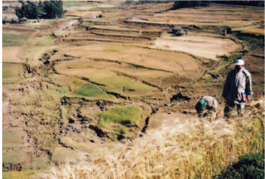
Soil erosion due to poor conservation, North Shewa, Amhara Region, Ethiopia