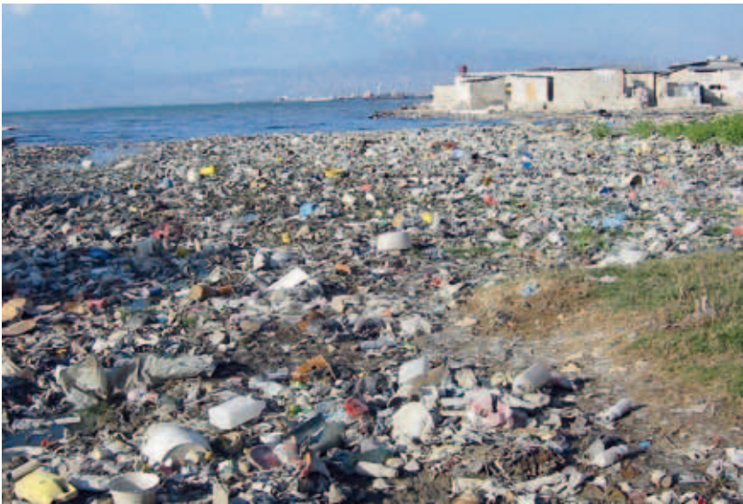
People living along the coast are at risk of sea level rise.

There is a risk that those managing rented land invest less in conserving such land than if they owned the land. As land renting expands there is a growing need for legislation that protects rented land by signaling clear responsibilities of owners and tenants. Longer-term contracts may reduce this problem and very long-term contracts, i.e. 99-year leases are treated almost like sales. Enforcement of longer-term contracts may be an option but that may also reduce the flexibility advantage of short-term contracts. Imposing sustainable management requirements as a part of the contract may be an alternative approach that should be tested in diverse environments.