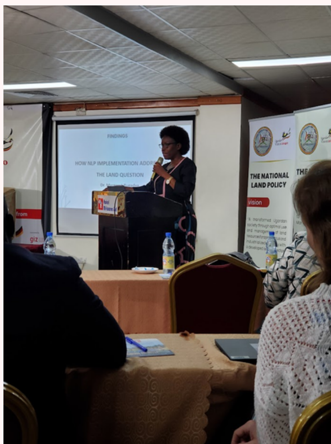
Minister of Land, Housing and Urban Development Hon Judith Nabakooba