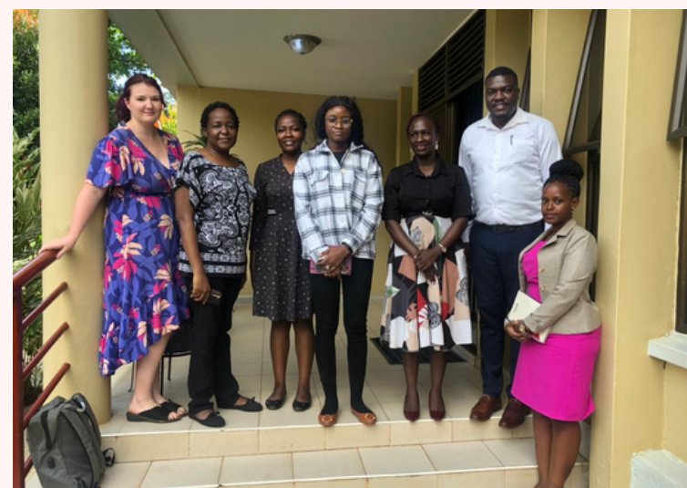
SSA, Rooftops Canada & UN Habitat