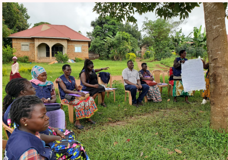
Meeting with Mityana paralegals