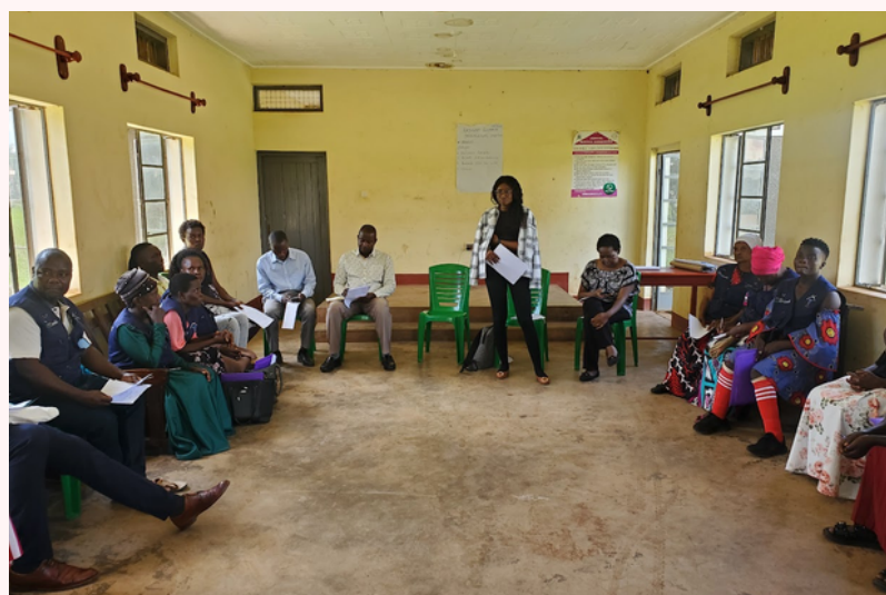
SSA, Rooftops Canada meeting Kayunga paralegals