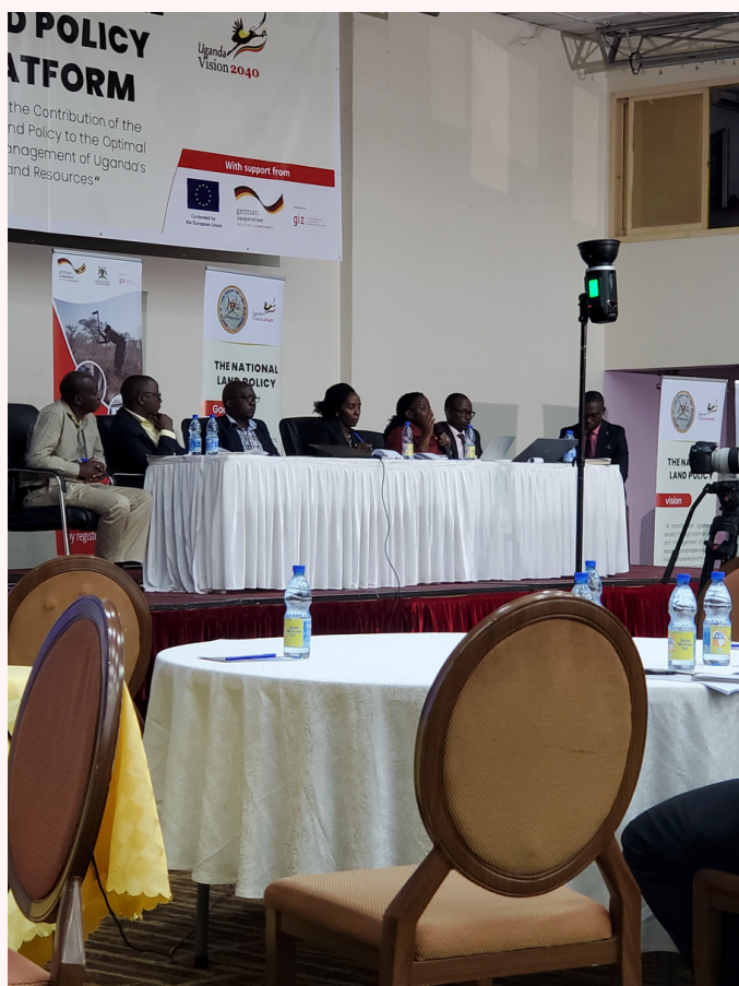
Panel discussion on the National Land Policy

As the National Land Policy is set to be rewritten this year, key stakeholders in the land and housing sector gathered to discuss the current policy, its successes and shortcomings, and suggestions for the future edition.