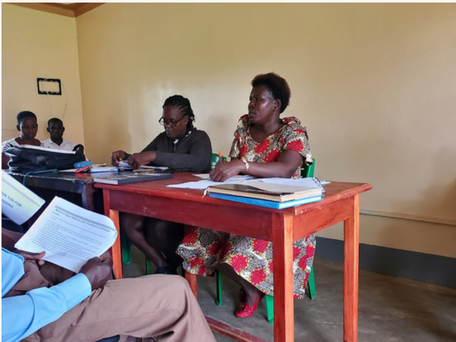
Kayunga Municipality leaders